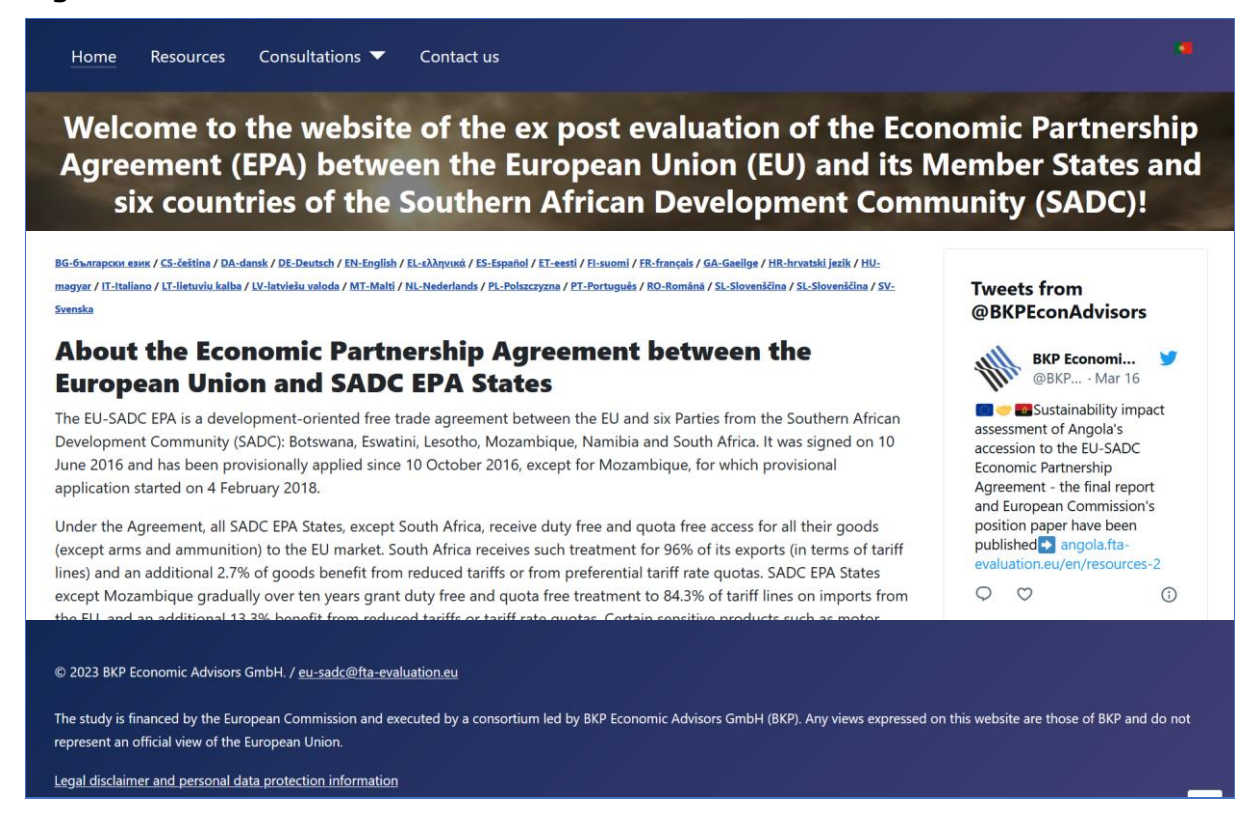
Figure 1: Screenshot of evaluation website

The use of metadata (keywords and strings of words) will ensure that the website is found easily on search engines in order to increase visitor counts and further impact. The website address will also be promoted among a large range of stakeholders and partners.