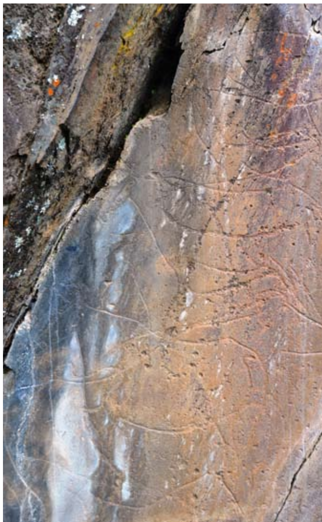
Pedro Nuno Caetano

Neighbours have the task of monitoring a small part of the Grand Route and reporting to the managing organization any problems (e.g. river floodings,