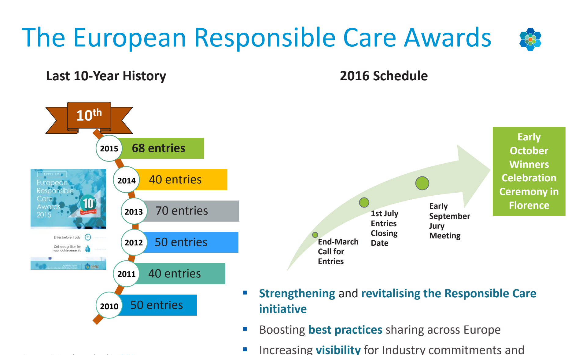
Competition launched in 2004